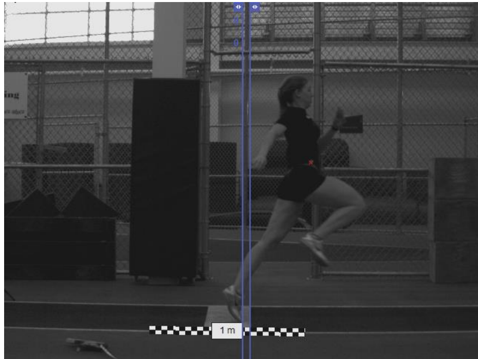
Figure 2. Measurement calibration for jump distance and velocity.

coordinates defined vertical motion. Velocity was then calculated for each coordinate using the following equation, v(\text{frame}) = [v(\text{frame} + 1) - v(\text{frame} - 1)] / t , where t is the time between the two frames (0.01 sec). Figure 2 depicts the calibration of the aforementioned measurements.